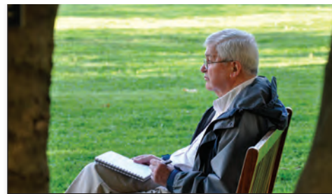
Silence and Reflection

The Academy's commitment to an authentic spirituality promotes balance, inner peace and outer peace, holy living and justice living, God's shalom. Theologically the focus is Trinitarian, celebrating the Creator's blessing, delighting in the companionship of Christ, and witnessing to the power of the Holy Spirit to transform lives, churches, and the world.