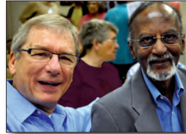
Guidance from mentors