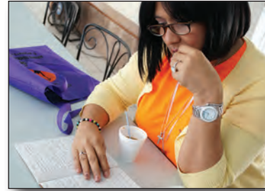
Study and growth