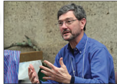
Listening and learning

Loving, spiritual guidance for the community is offered by the leadership team. These are persons who have completed the two-year Academy, and they are there for you as servant leaders. Two faculty presenters offer guidance at each session; they are authors, seminary professors, monks, spiritual directors, and pastors, carefully chosen for both their knowledge and their wisdom.