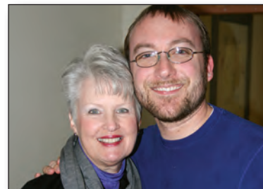
Deepening relationships and community

The Church and the world long for spiritual leaders of all kinds: extroverts and introverts, lovers and dreamers, builders and thinkers. The Church and the world need passionate, persistent, authentic, well-grounded people of faith, centered in the love of God. Spiritual leaders who abide in the Source (Jn 15:5) bring fresh energy and new life to the world that needs them. The Academy is a proven place for renewal and call. We welcome your application.